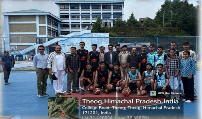
Theog, Himachal Pradesh, India College Road, Theog, Theog, Himachal Pradesh 171201, India Lat 31.120624, Long 77.356791