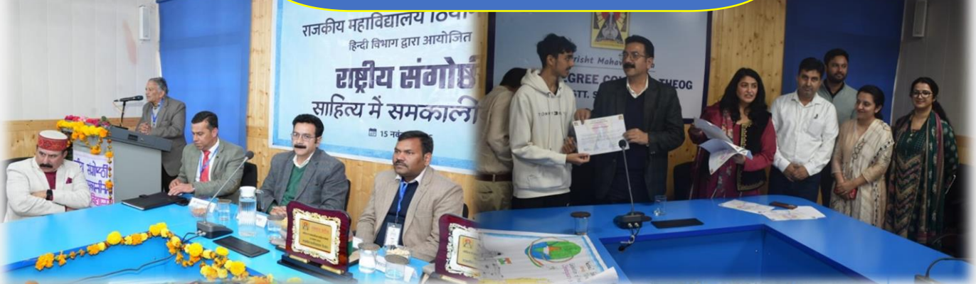
Theog, Himachal Pradesh, India College Road, Theog, Theog, Himachal Pradesh 171201, India Lat 31.120529, Long 77.355631 08/07/2025 12:21 PM GMT+05:30