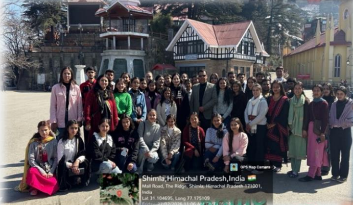
Shimla, Himachal Pradesh, India Mall Road, The Ridge, Shimla, Himachal Pradesh, 171001, India Lat 31.104695, Long 77.175109 Friday, 22/02/2025 11:06:11 AM GMT+05:30