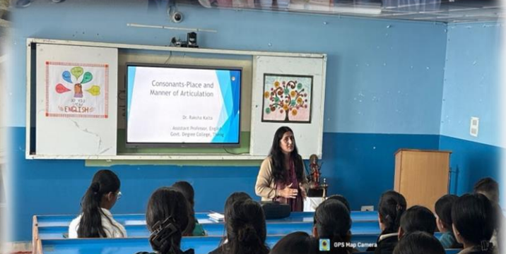
Theog, Himachal Pradesh, India College Road, Theog, Theog, Himachal Pradesh 171201, India Lat 31.120608, Long 77.356138 Wednesday, 12/11/2025 11:22 AM GMT+05:30 Note: Captured by GPS Map Camera