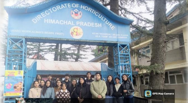
Shimla, Himachal Pradesh, India 35rr+825, Nav Bahaar Directorate Rd, Navbahaar, Chotta Shimla, Shimla, Himachal Pradesh 171006, India Lat 31.090844° Long 77.190353° Friday, 26/12/2025 10:56 AM GMT+05:30