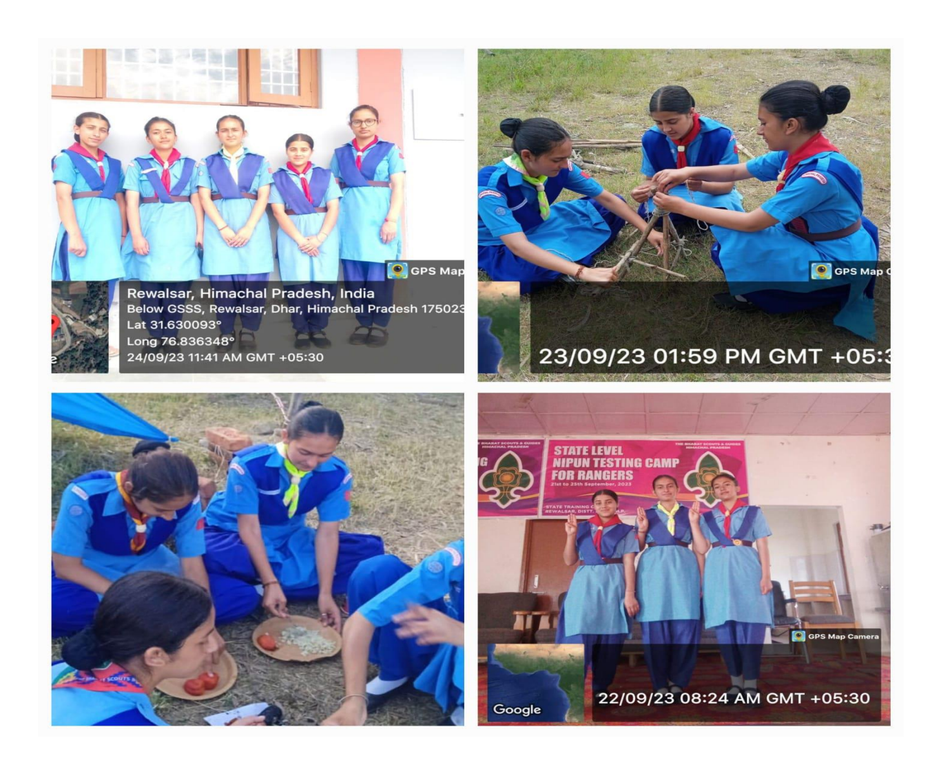
Pic: Five rangersof R&R Unit of G.C. Theog, participating in different events during the "State Level Nipun Testing Camp for Rangers" w.e.f. 21<sup>st</sup> Sep. to 25<sup>th</sup> Sep. 2023.

Activity no. 4: On October 3<sup>rd</sup> 2023 Rovers and Rangers unit and department of Public Administration jointly organized campus cleanliness drive. As our college is going to host HPU inter college women's basketball championship on 6<sup>th</sup> and 7<sup>th</sup> October 2023. Students voluntarily provided their services in this intercollege level event. Objective of this cleaning drive was to inculcate social and institutional dutifulness among students.