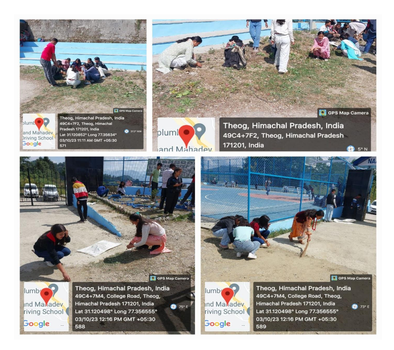
Pic: Rovers and Rangers unit members and students of department of public administration participating in the college campus cleanliness drive on October 3, 2023.

Activity no. 5: Communal Harmony week was celebrated by Rovers and Rangers Unit, department of public administration, NSS and NCC Unit of Govt. College Theog, during 19 Nov. 2023 to 25<sup>th</sup> Nov.2023.Inaddition voluntary donation collected from principal madam, teaching& non teaching staff members, and students contributed for the same.Further members of Rovers and Rangers Unit and other Units of the college also visited Shali Bazar market, different govt. offices of Theog, for the collection of funds. Communal Harmony Flag Day was celebrated on 24 November under the chairpersonship of our worthy principal madam Dr. LalitaChandan. In this event spot slogan /title writing competition was organized in which 43 students participated.Principal madam in her address mentioned the importance of communal harmony in our society.Communal harmony flag stickers were also distributed among teaching & non teaching staff members and students of the college.At the end of the event madam principal administered communal harmony pledge. The collected fund of rupees twelve